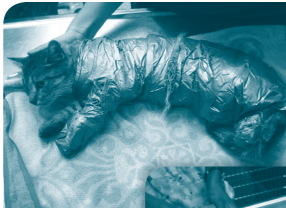
Above, Sticky in the Intensive Care Unit of the Pennsylvania SPCA veterinary hospital before having the duct tape carefully removed. Right, Sticky after the tape was removed.