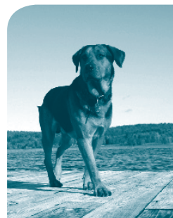
Cooper enjoys life at his new home in New York.