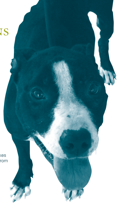
Ringo takes a break from training.