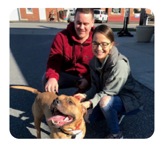
Follow the PSPCA Lancaster Center on Facebook at www.facebook.com/pspcalancaster

He loves hikes in the park, hanging out in the house, and is even a good boy in the bath — and thanks to our Facebook community, Teddy finally found his forever home!