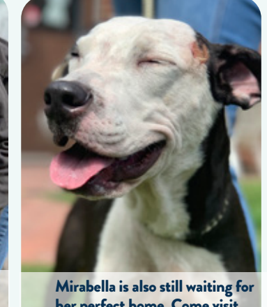
her perfect home. Come visit her today on Erie Avenue!