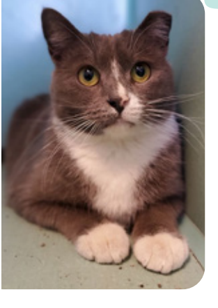
Follow the PSPCA Danville Center on Facebook at www.facebook.com/pspca.danville